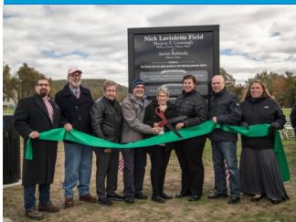
Dedication of the Fitness Trail at Laviolette Field